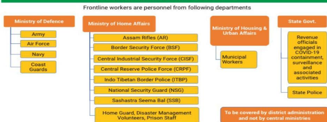
FIGURE 7.3: FRONTLINE WORKERS CATEGORIES

Municipal Workers: are defined as "all workers* who are engaged in providing any form of public health, sanitation and waste management services for the city or town"